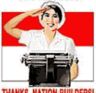
THANKS, NATION-BUILDERS We Couldn't Control The People Without You