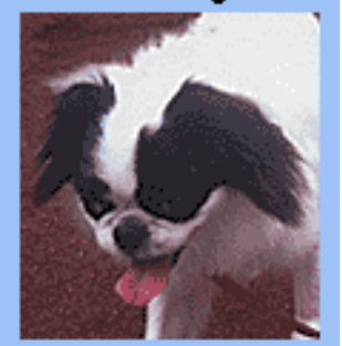
Click here for more